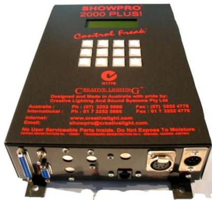
Showpro 2000 PLUS V4 DMX512 controller Made in Australia for over 15 years.

Due for retirement in 2010/11, the Showpro V5 is currently under development