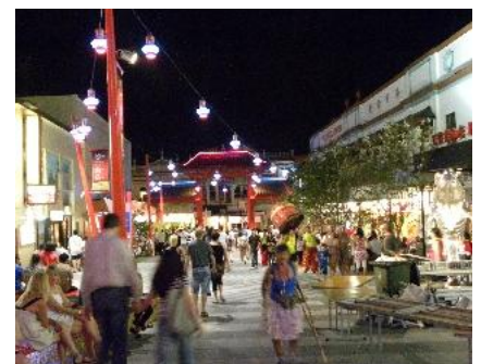
In 2010, the latest Showpro installation is the control over all RGB leds in Chinese lanterns, water features, gates and Grand Awning at Chinatown Mall, Brisbane. Programming was done wirelessly by PC to the Showpro.