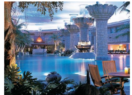
Showpro - Oriental Plaza, Beijing China

The Showpro has been installed in hundreds of projects around the world since 1994.